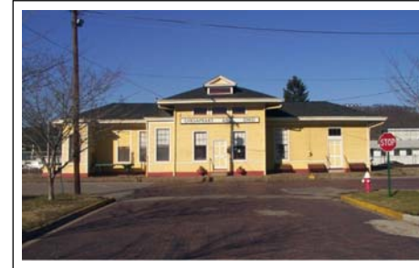
C&O Depot ca. 1906