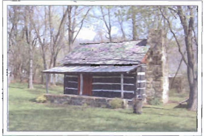
Morgan's Kitchen ca. 1846